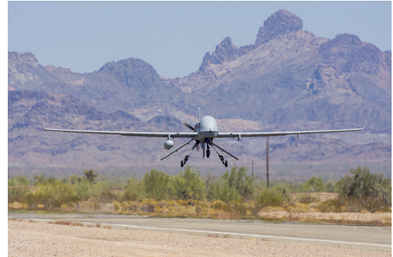
An Extended Range / Multipurpose (ER/MP) Unmanned Aircraft System (UAS), returns from functional testing during Project Convergence 20, at Yuma Proving Ground, Arizona, September 15, 2020.

There are three independent programs ongoing, to integrate ISR, C2, and weapons systems in a tactical mesh network. The Air Force has Advanced Battle Management System (ABMS), the Army has the Integrated Battle Command System (IBCS), and the Navy has Cooperative Engagement Capability (CEC). Those are now being integrated into the Pentagon's Joint All Domain Command and Control (JADC2) system. 40 The services have always had rivalries and animosities with each other. As an example, AF General Curtis LeMay was asked who he favored in the upcoming Army-Navy football game by one of his staff. He chomped on his cigar and said, "I hope they both lose". But those days are over. In early September, the Air Force and Army signed an agreement to work together and change the name JADC2 to Combined Joint All Domain Command and Control (CJADC2). 41