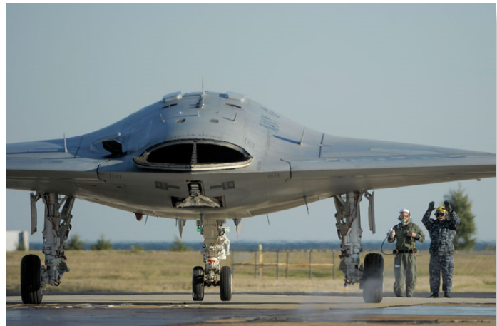
X-47B UCAS Control Display Unit Testing, Pax River, Fall 2012

In November of 2012, the U.S. Navy initiated carrier testing of the next generation of UAVs - the Northrop Grumman X-47B. 12 This jet-powered UAV is considerably larger than the Predator and has a payload of 4,500 pounds, ten times the payload of the CTC Predator carrying the Hellfire missiles. 13