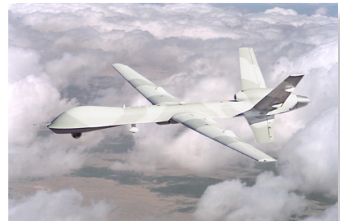
Predator B is powered by a turboprop engine and can carry a greatly increased payload.

After considering long-range optics (satellites), land-based sensors, and balloon-based optics, the CTC finally decided that a UAV sensor platform was most appropriate for the reconnaissance (locate and identify) mission segment. The Special Activities Division (SAD) of the CIA had a small UAV they had been playing with but were reluctant to give it up. So the CTC went to the Air Force who had an early version of the Predator (RQ-1) that was used for intelligence missions in the Balkans. 5 Air Force officials were happy to relinquish this bird; the top Air Force brass disliked any aircraft that did not rely on a human pilot with hands directly on the controls. At the time this Air Force-owned UAV was just sitting in a hangar without planned missions.