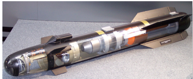
A model of a Hellfire's components.

A CIA terminal ballistics expert was brought in to evaluate all of the smaller weapons that could be mounted on the Predator. She was a quiet, older woman whom everyone referred to with the affectionate appellation, "The Black Widow." After studying pressure curves, blast radius figures, fragmentation patterns, and kill radius data on appropriate weapons in the U.S. arsenal, she decided that the Hellfire Missile was the best option. 9 At this time, the Hellfire had been used effectively for 15 years as a weapon on attack helicopters to neutralize enemy artillery and tanks on the ground. Each missile weighed 100 pounds, including the 20-pound high-explosive (HE) warhead. Two missiles could be attached to the Predator, one under each wing. The missiles, combined with the on-board laser targeting system and the mechanical hangers on the wings, had to weigh less than the 450 pound payload limit of the RQ-1 Predator.