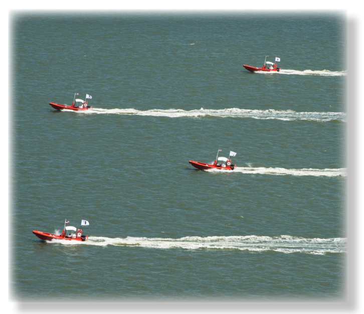
Four unmanned remotely operated high-speed maneuvering surface targets move to their blocking positions during an Office of Naval Research-sponsored demonstration of autonomous swarmboat technology on the James River in Newport News, Va. During the demonstration as many as 13 Navy boats, using an Office of Naval Research-sponsored system called CARACaS (Control Architecture for Robotic Agent Command Sensing), operated autonomously or by remote control during escort, intercept and engage scenarios.

Carl von Clausewitz first used the term "The Fog of War" ("On War", 1832). He generally describes the phenomenon as the confusion, uncertainty, and chaos in battle due to a lack of reliable intelligence information. In 6GW, our systems will enhance and amplify this condition for our enemies. They will make decisions and commit military resources based on the false information we feed them. Or, they will fail to commit